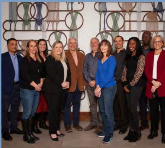
ADAA Board of Directors

The Anxiety and Depression Association of America (ADAA) is the only non-profit (501c3) multidisciplinary professional organization in mental health engaging the world's leading clinicians and researchers.